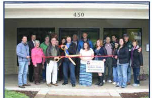
Dallas Church • 450 SW Washington