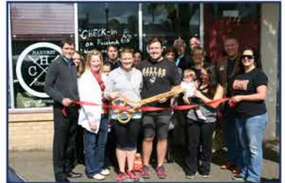
Harvest Crossfit • 172 SW Court St

Contact information: Dallas Chamber www.dallasoregon.org/dacc www.facebook.com/DallasOregonChamber chamber@dallasoregon.org