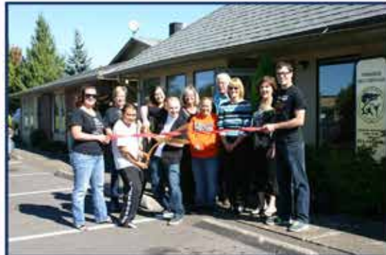
Parkside Self Defense • 289 E. Ellendale, Suite 501