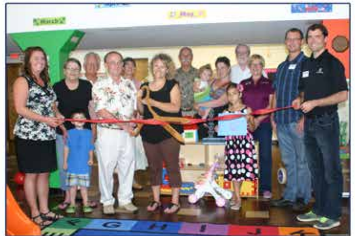
Roger Jordan Community Park Playground on July 17.