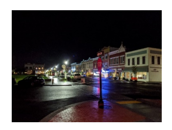
and private spaces