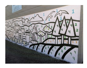
Public art is a real economic