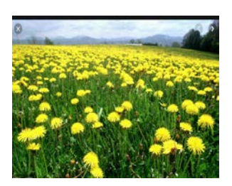
And why not?

First off, Dallas is growing like a weed, a nice weed.