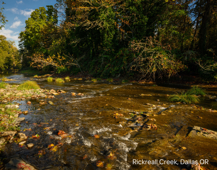
Rickreall Creek, Dallas OR